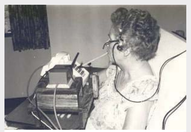
Adapted telephone 1960s.

With a shift in the profession's practice, a time of adaptive equiptment and technologies began to emerge. As technology became more sophisticated, the creativity and ingenuity of occupational therapists would grow to meet many challenges. Just looking at older forms of adaptive equipment can remind us of how inventive and accommodating occupational therapists were required to be.